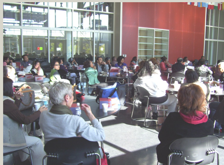
SABSE'S PARENT FORUM 2012